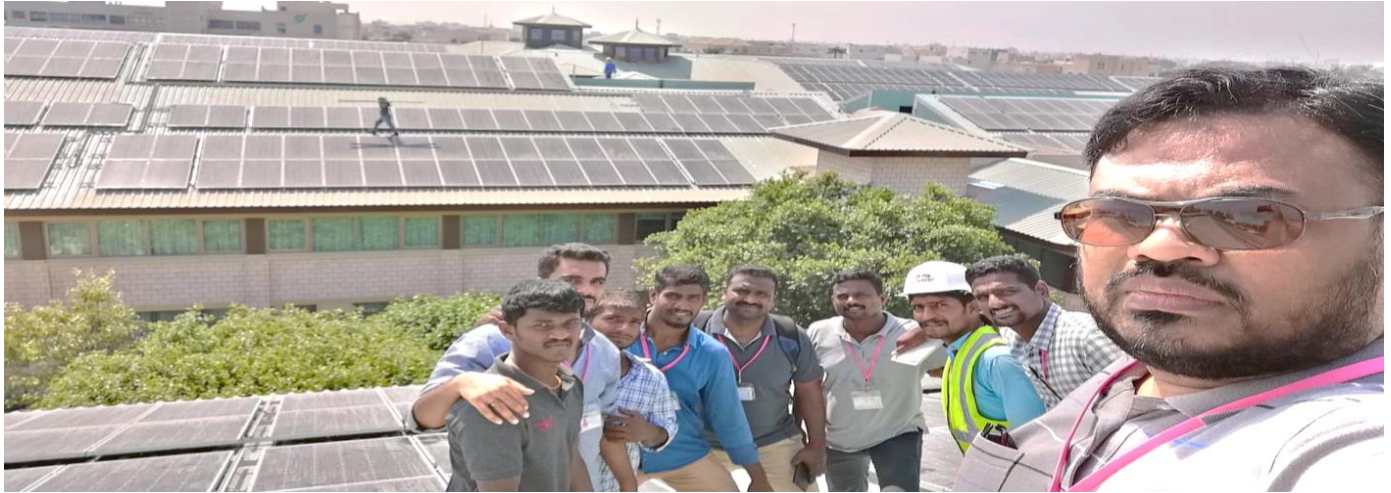
Project Executed in the Kingdom of Bahrain (1.25 MW)