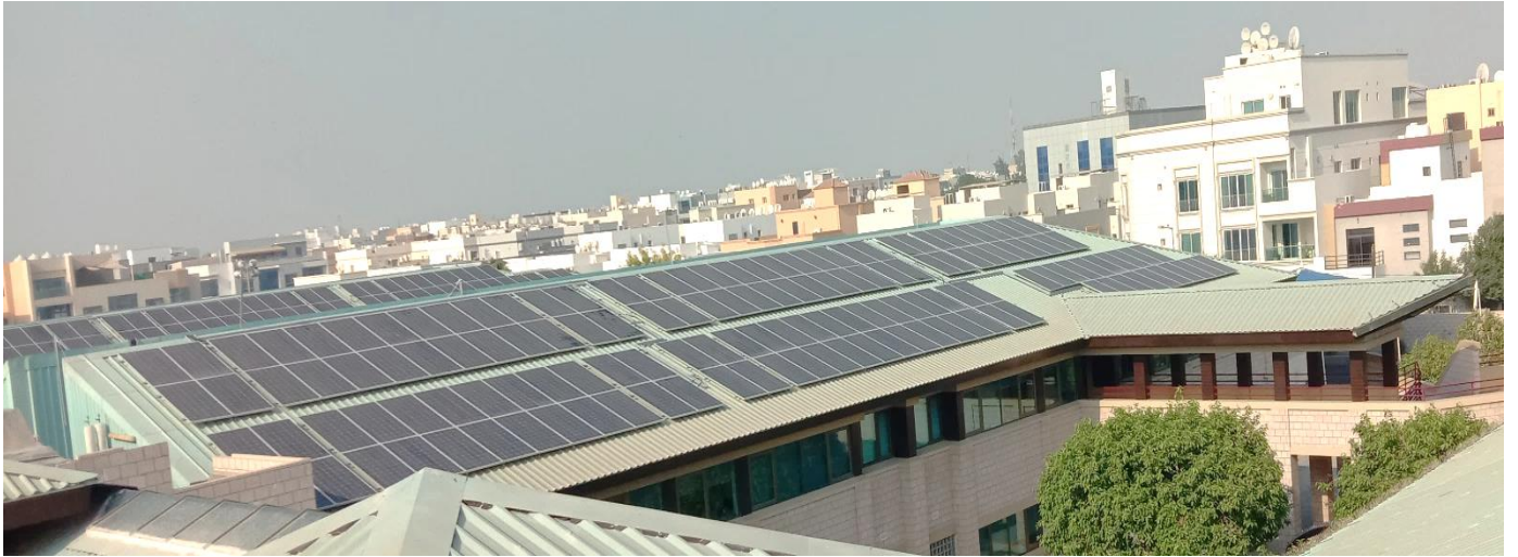
For M/S. Techmaaxx WLL, Bahrain for a School at Saar in the Kingdom of Bahrain.