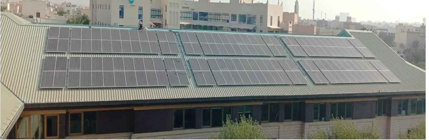
Transun has Completed one of the Largest Rooftop Solar Power Plant (Capacity 1.25 MWp (Megawatts) in the Kingdom of Bahrain for M/S. Techmaaxx WLL, Bahrain for a School at Saar.