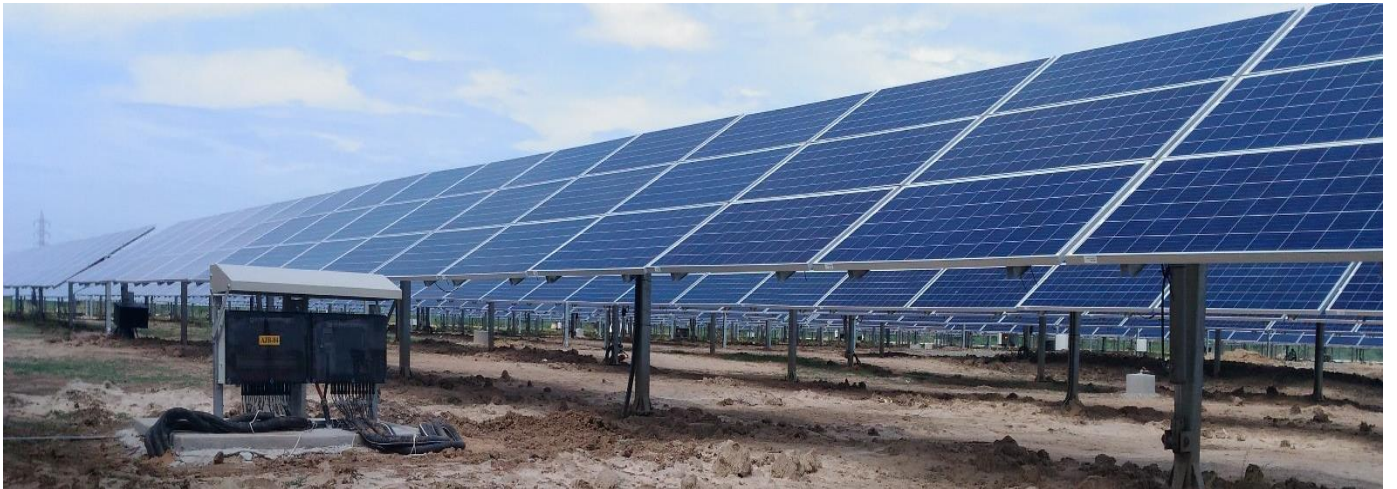
20 MWp (Megawatts) in Telangana, India (The Highest Capacity of a Single Project Executed)